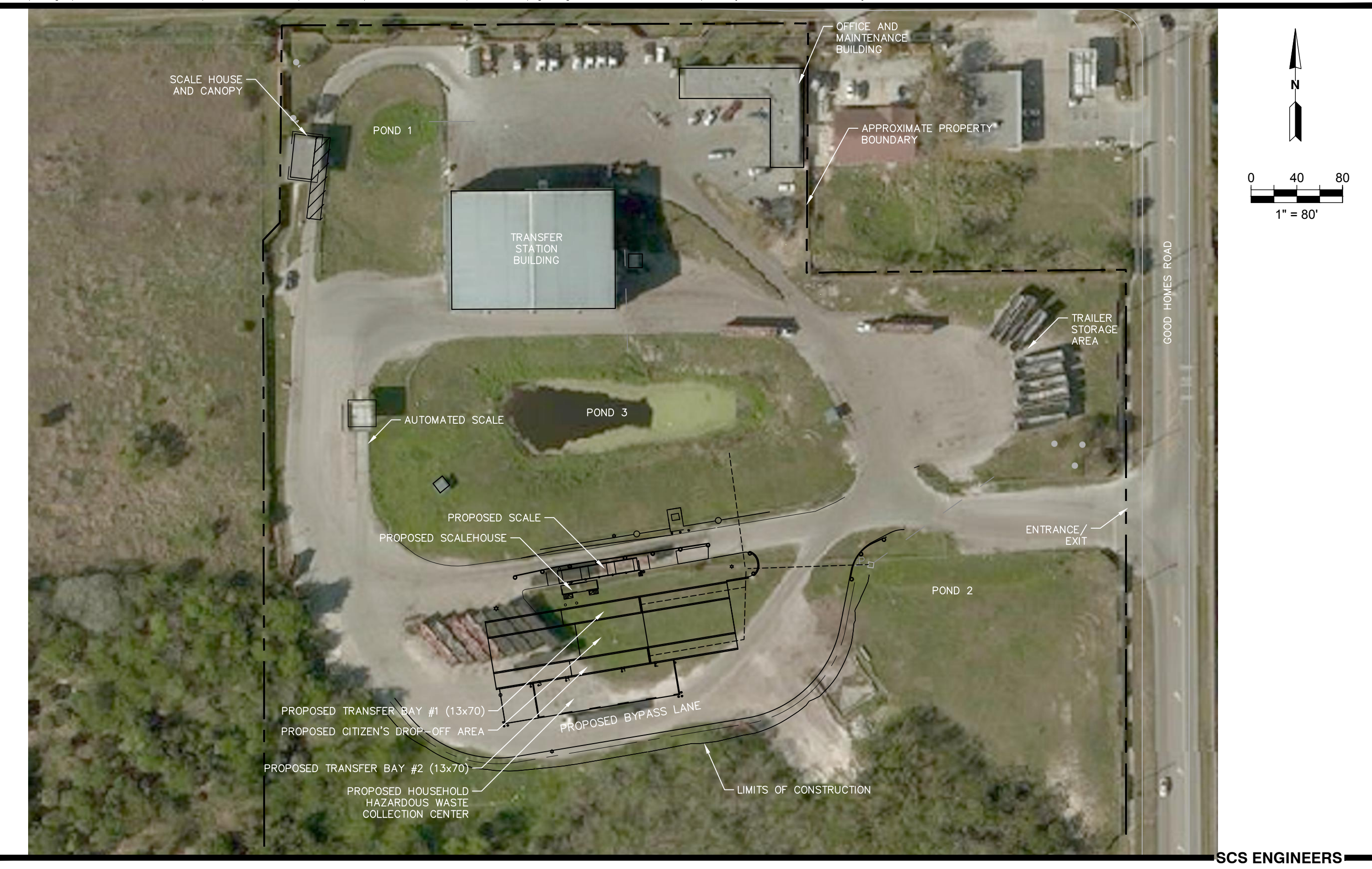
FIGURE 1. EXCAVATION AND DISPOSAL PLAN PORTER TRANSFER STATION SITE IMPROVEMENTS PROJECT

G: \PROJECT \Orange \09216054.01 Porter TS \Item 3 - Site Improvements \Excavation and Disposal Plan \Fig1.dwg Mar 23, 2018 - 3:59pm Layout Name: EXISTING By: 4382kkc