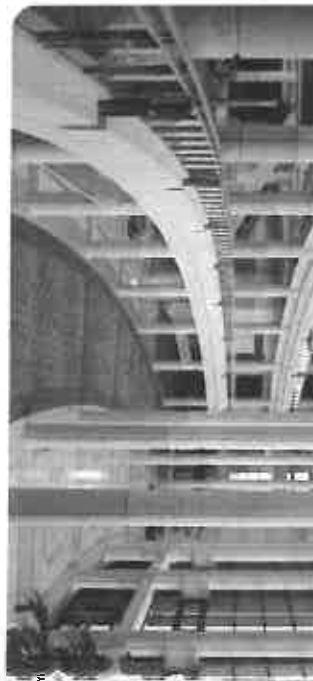
Six exhibition halls on Level II; two are column-free, providing unobstructed sight lines for general sessions or entertainment functions.