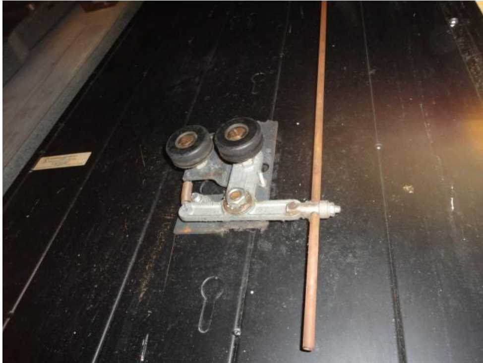
The hoistway door unlocking devices (top picture) and interlocks (bottom picture) will be replaced with new and compatible with new door operation.