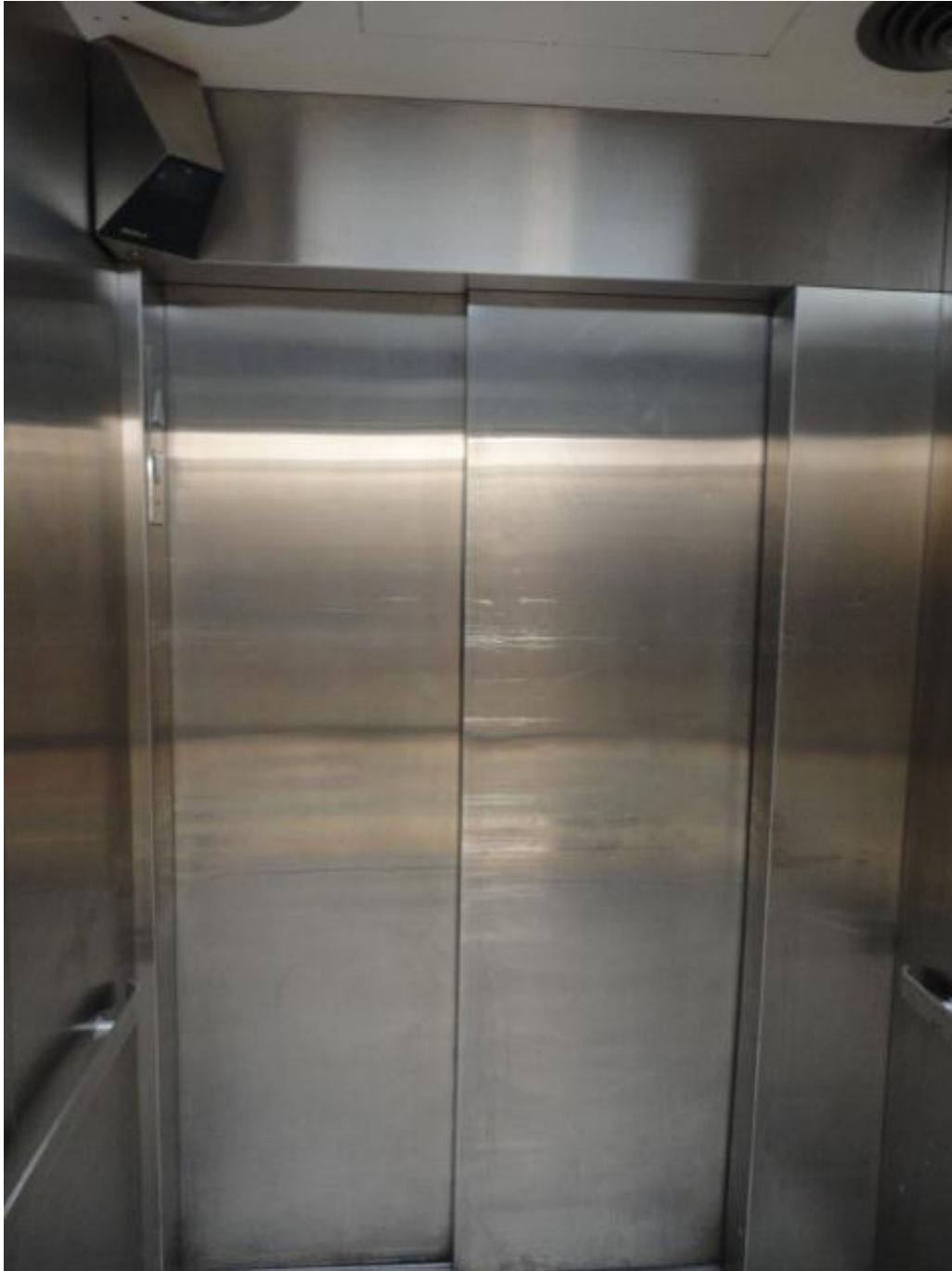
All elevators have two speed 48 inch side opening front doors and one elevator has rear opening doors on the lobby floor only with lanterns in one return jam.