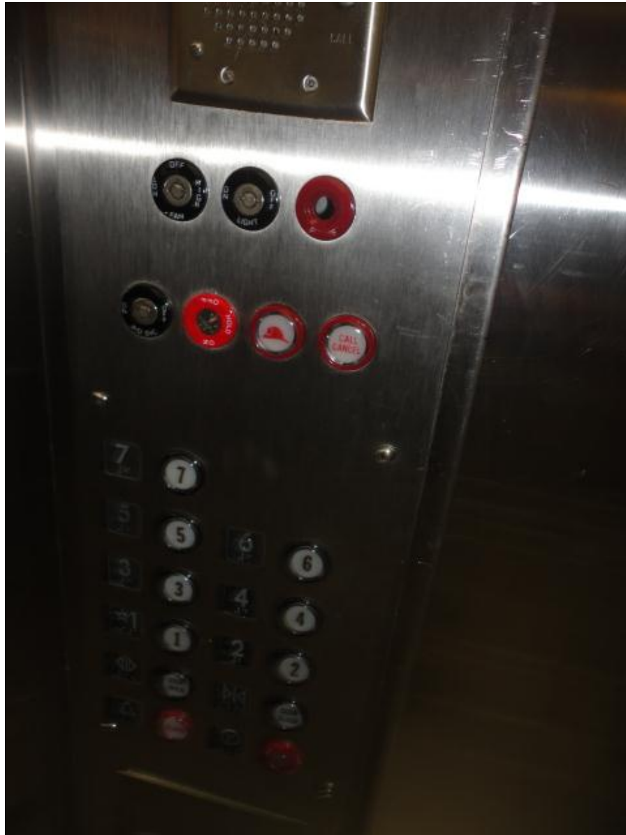
The existing car operating panels will be of a new vandal resistant LED design