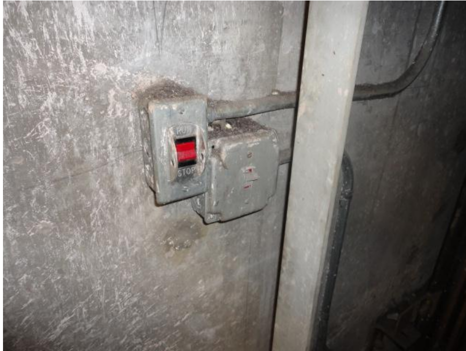
Pit light and stop switches shall be installed in accordance with the latest code.