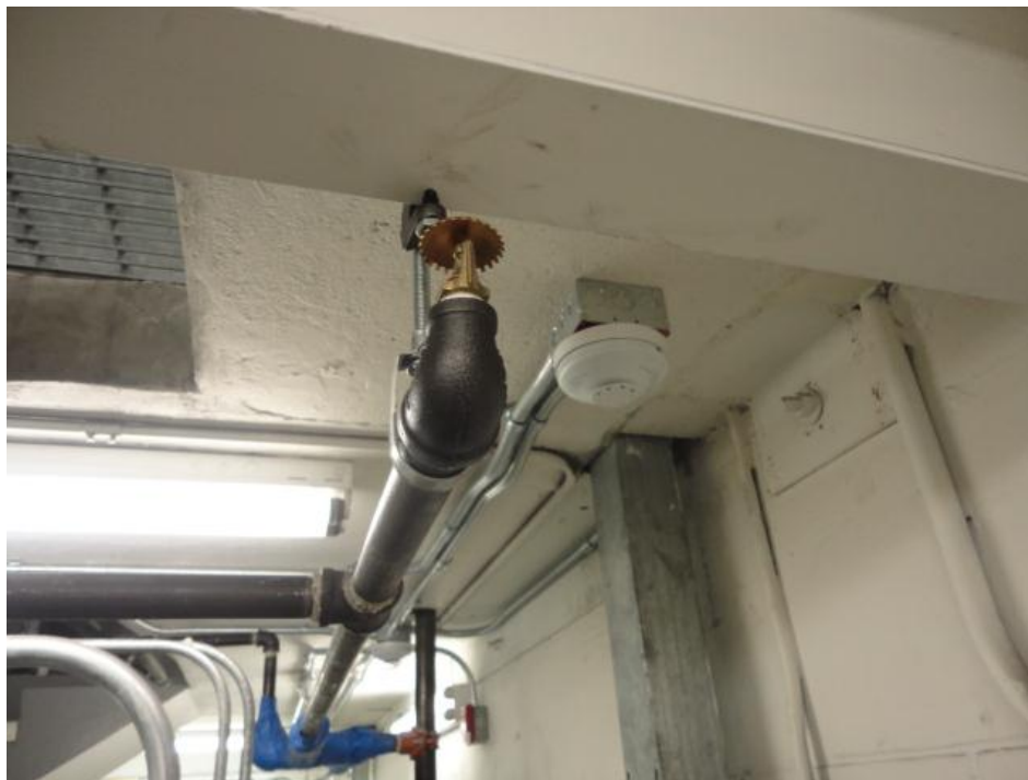
Sprinklers are installed in the machine room which requires shunt trip to the electrical system.