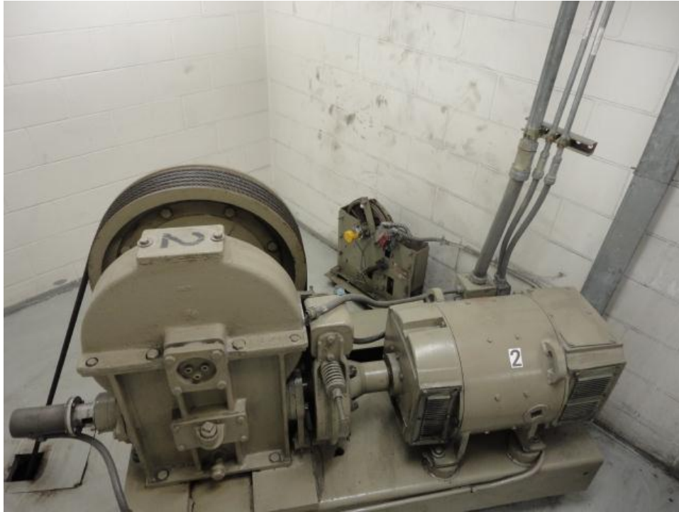
While the machines will be refurbished, new rope grippers and rope guards will be installed for safety.