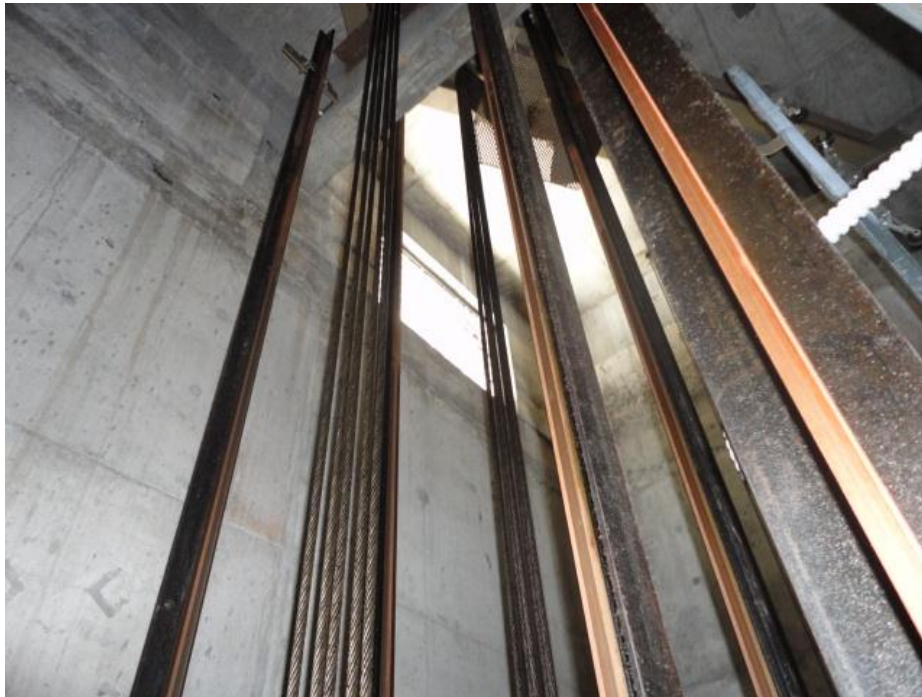
Hoistways do have ventilation, but should review to ensure compliance with code requirements at time of job permitting and consideration for a water prevention type screen.