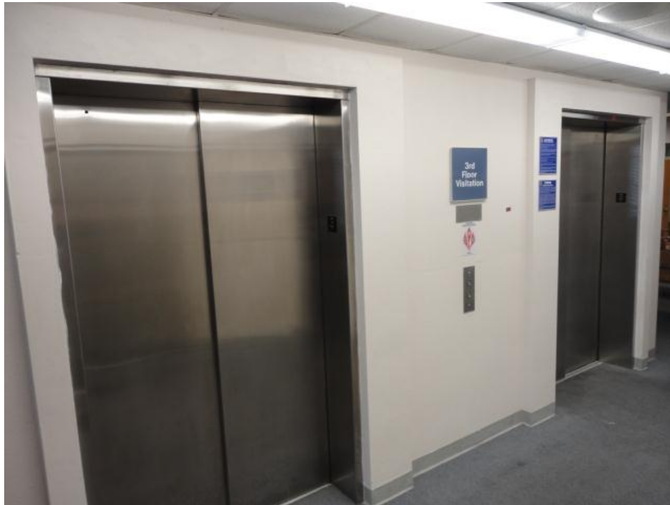
Upper Floor Lobby Example. Single riser, no hall lanterns or PI's