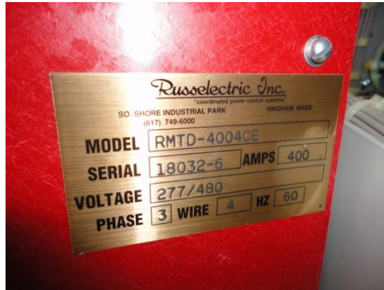
Existing Automatic Transfer Switch