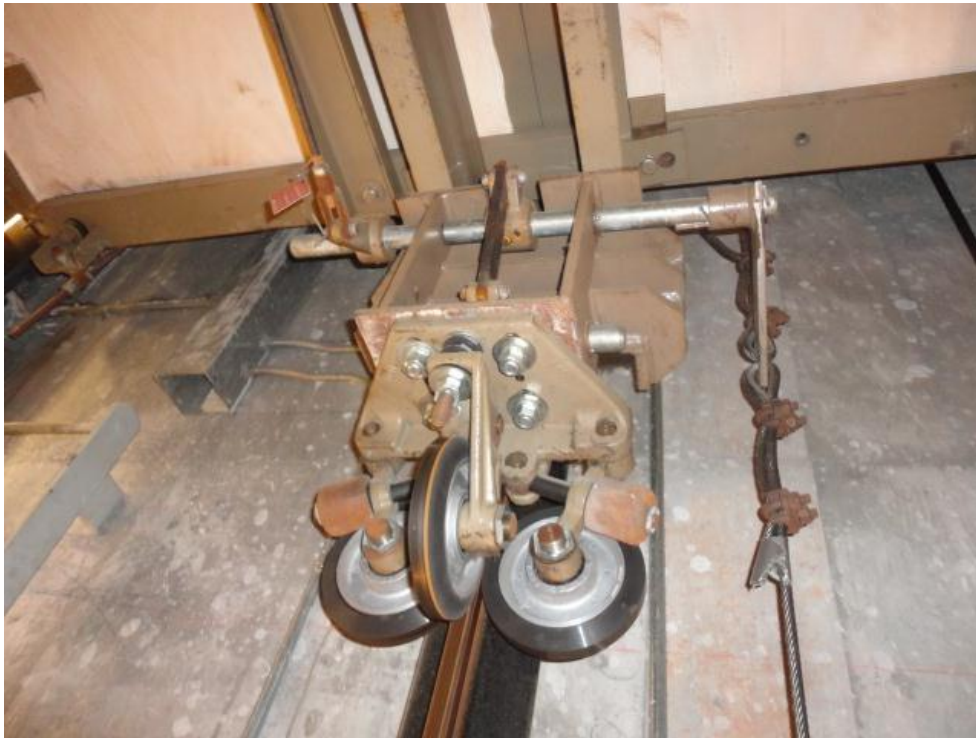
Car and Counterweight roller guide assemblies will be retained and rollers replaced as needed.