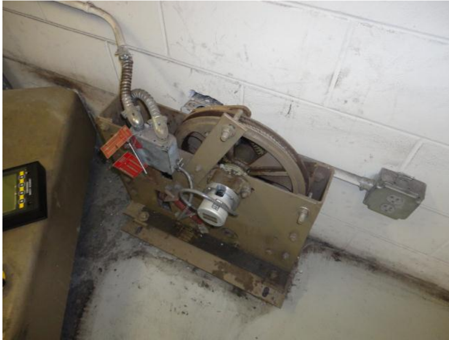
New centrifugal governor will be installed as it is a component of life safety and should be upgraded.