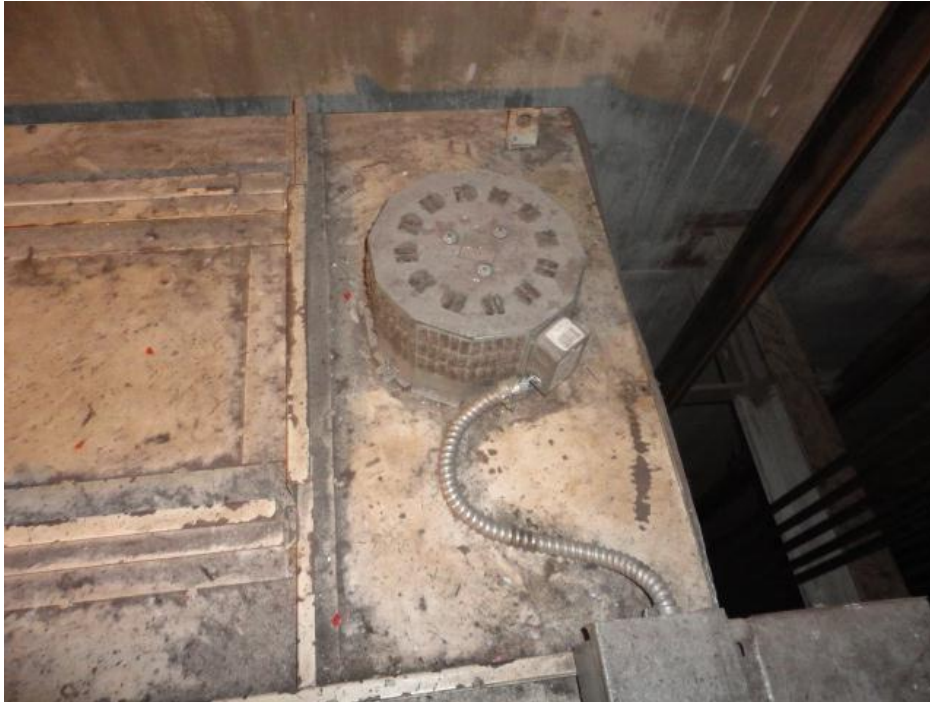
Car top fans will be replaced with a battery back up blower.