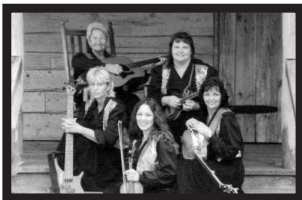
THE RAMBLIN' ROSE BAND