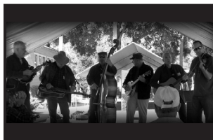
NEW RIVER BLUEGRASS